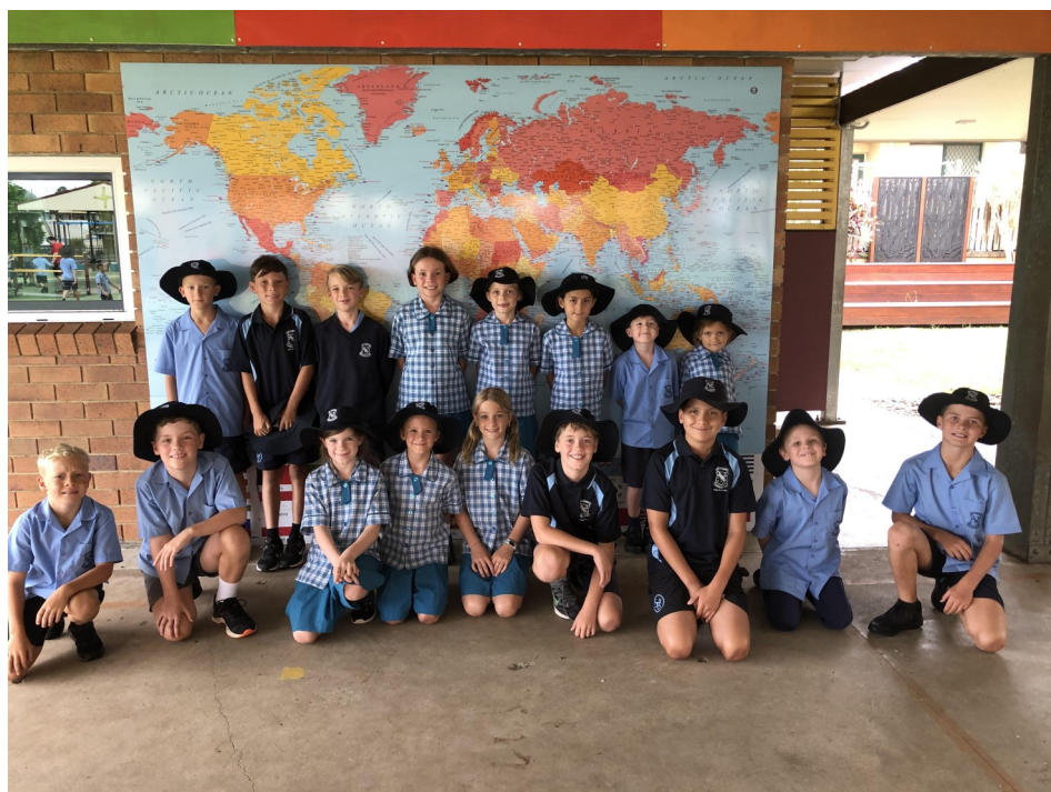
New students in Years 1-6 ↓