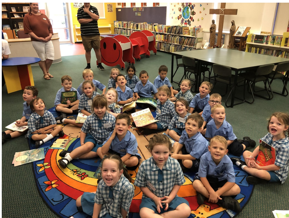
2020 Kindergarten ↑